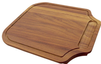
Iroko-wood chopping board 8655 000