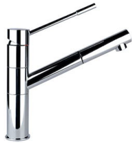
Mixer Tap Lorenzo 8466 000