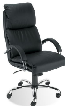
NADIR ST02-CR PF27-CR TILT/C