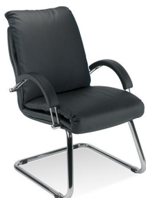
NADIR-LB CF-CR PF27