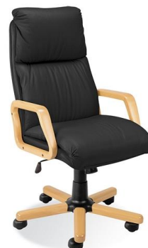
NADIR STW01-1.007 PF22-1.007 TILT/C