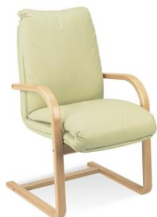
NADIR-LB CF-1.007 PF22-1.007