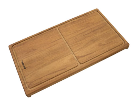
Iroko-wood sliding chopping board 8643 000