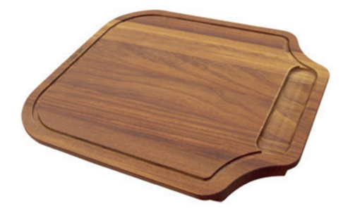
Iroko-wood chopping board 8655 000