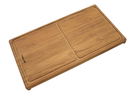
Iroko-wood sliding chopping board 8643 000