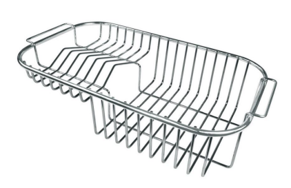
Stainless steel plate rack 8100 301