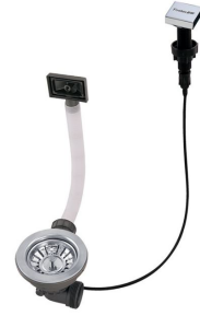
LIRA automatic waste fitting 8407 102