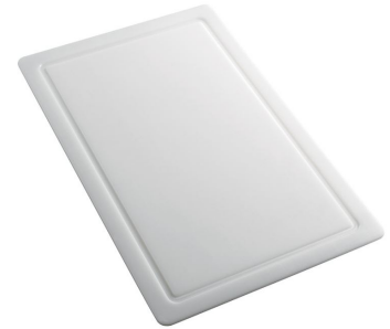
HPDE Chopping board 8657 001