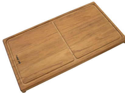
Iroko-wood sliding chopping board 8643 000