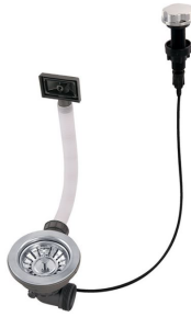
Automatic waste fitting 8407 100