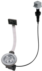
LIRA automatic waste fitting 8407 103