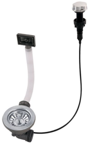
Automatic waste fitting 8407 000