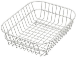
Cestello inox 8612 000