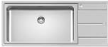
Sink Evo - 3216 05x