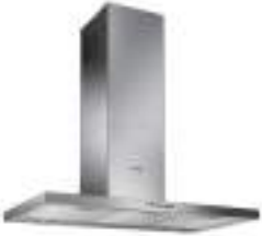
Hood KS 240_002